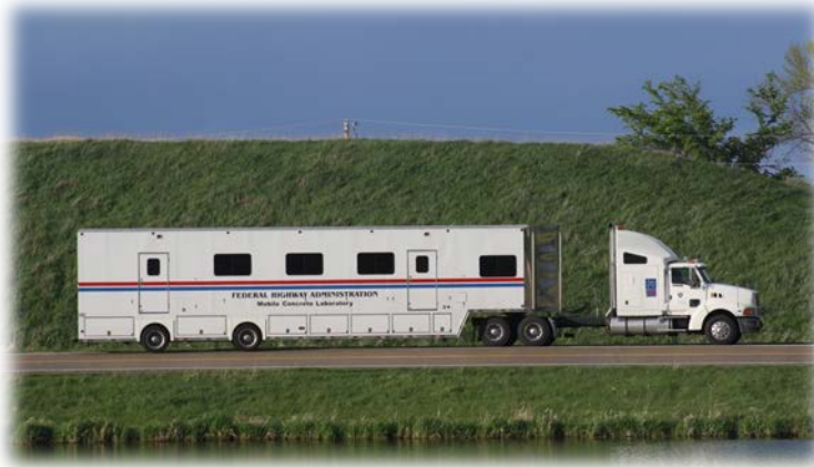
Overview of the MCT