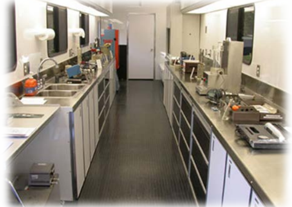
Inside the MCT